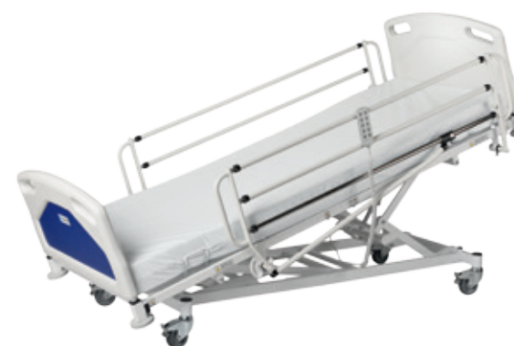
Reverse Trendelenburg position