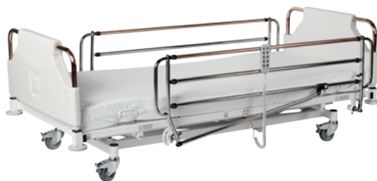
Version of the bed with copper plated side rails and head and foot boards