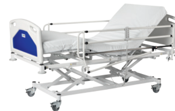
Sitting position (cardiological chair)