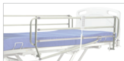
Side rails varnished, foldable