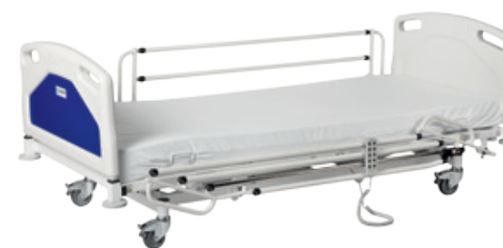
Low position of the bed