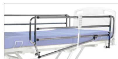
Side rails chromium plated, foldable