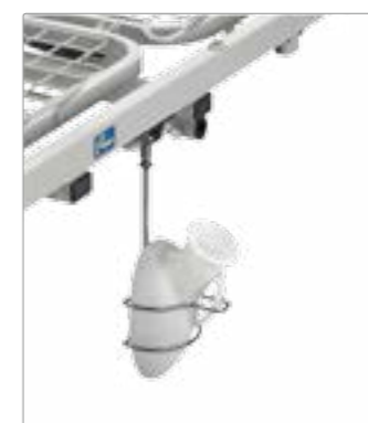
Urinal holder WL-19.3