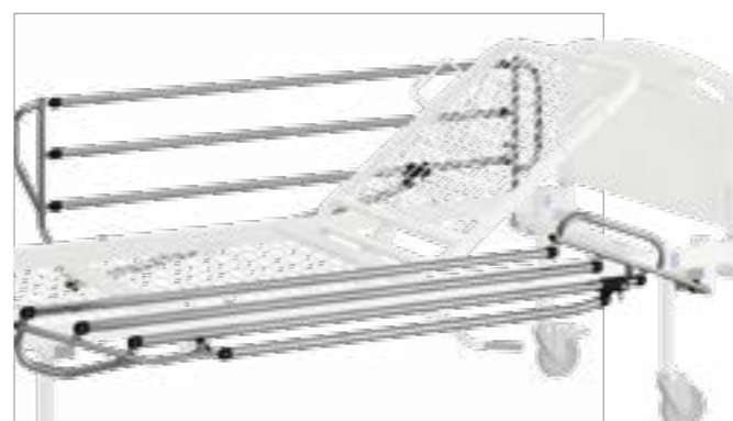
Side rails varnished, foldable PB-15.0 or chromium plated PB-15.1