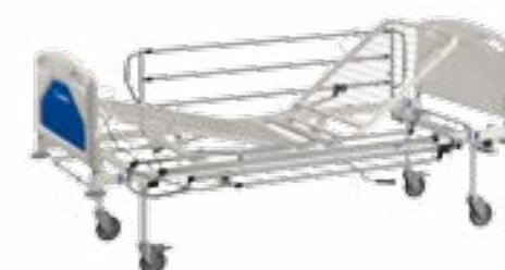
Rehabilitation bed LP-05 with four-section bed frame (with optional equipment)