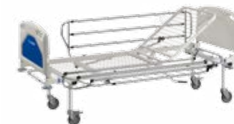
Rehabilitation bed LP-05 with three-section bed frame (with optional equipment)