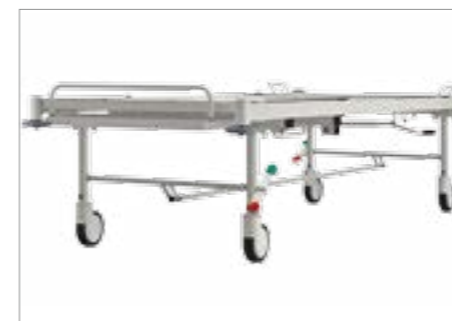
PL-45.1 – chassis with wheels with central brake with one directional wheel