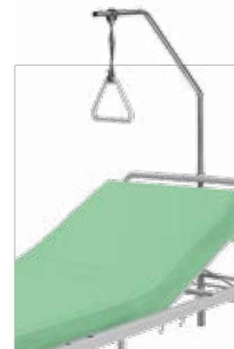
Hand holder UR-05.1 for LP-01.3 beds