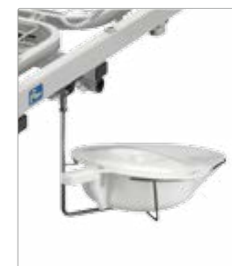
Bed-pan holder WL-20.3