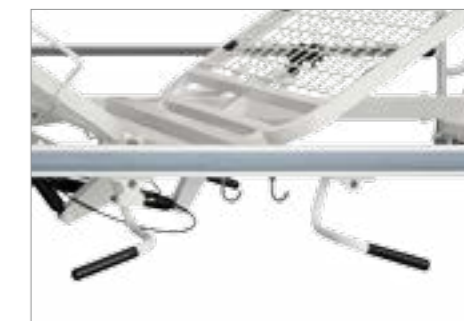
Side bumper WL-17.0