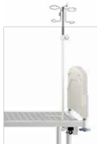
Drip bottle holder WK-06.1