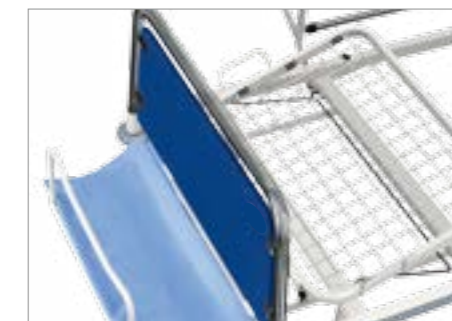
Shelf for bed clothes PL-16.0