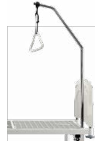
Hand holder UR-07.0 for LP-05 beds