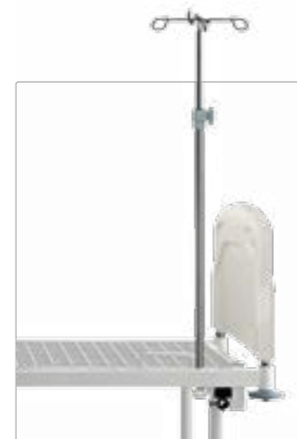
Drip bottle holder WK-16.0