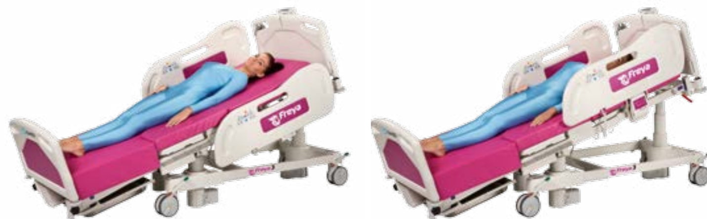
Reverse Trendelenburg position