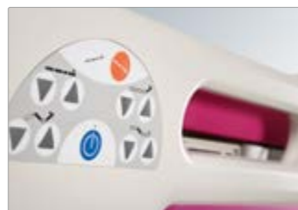
Control panel in side rail