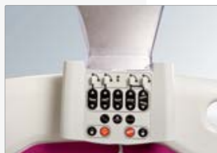
Central control panel (supervisor)