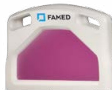
Plastic head and foot boards with inserts