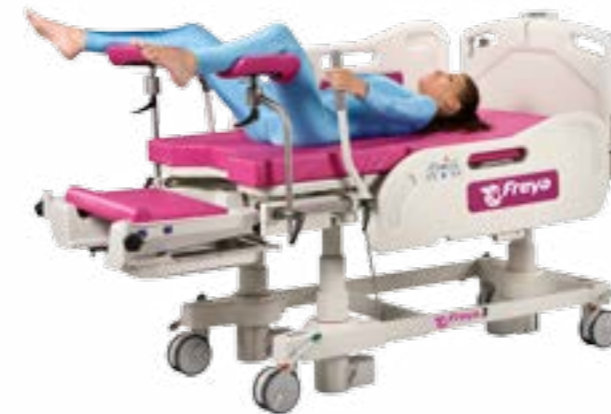
Horizontal position with a mattress for a new-born