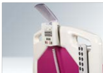
Central control panel and remote controller